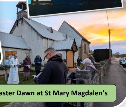
Easter Dawn at St Mary Magdalen's